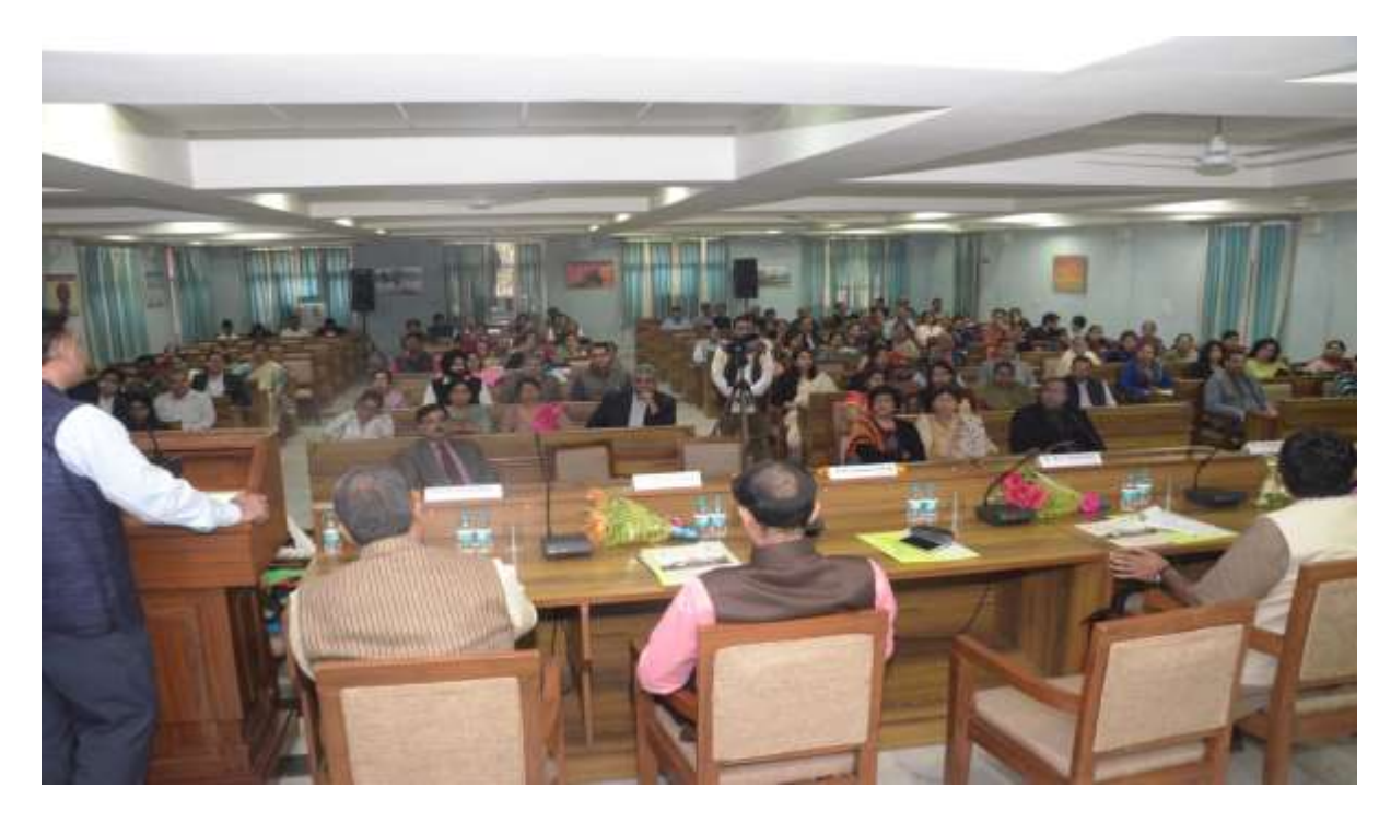
The Workshop came to a successful end with high-tea.